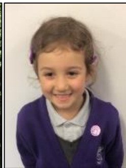
Newcastle: Ember and Lily