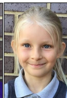
Northern Europe: Fin and Molly