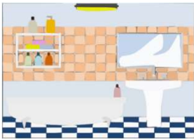
La salle de bains