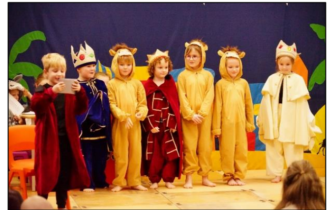
Year 2's Amazing Performance of Lights, Camel, Action!