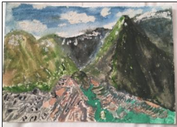
"Machu Picchu" By Evie