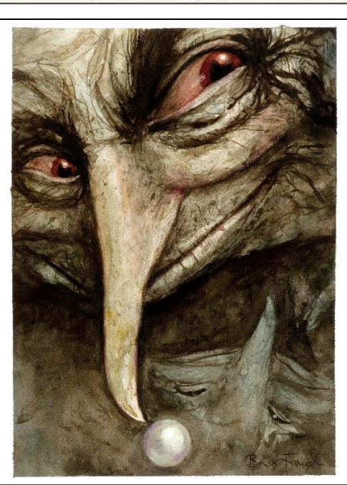
Activity 1. Make a list of any features that you can see e.g. hair, eye, nose, claw, toenails ...

List the features down the left-hand side of a page; it might help you to start at the top of a pictures and work your way down, so you don't miss any features – write as many nouns as you can.