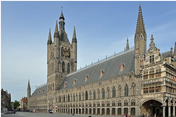
In Flanders Field museum