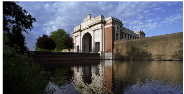
Menin gate war memorial