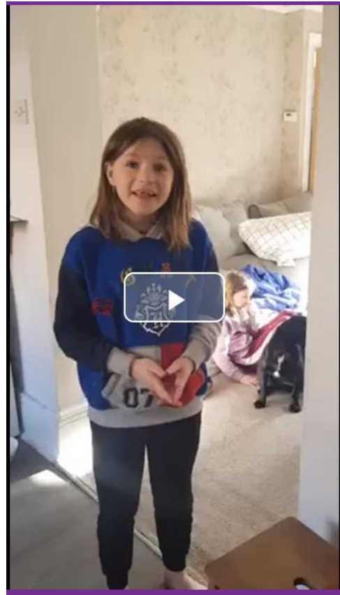
Comic Poetry Competition Winners