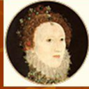
Elizabeth I 1558 - 1603