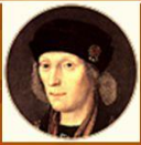
Henry VII 1458-1509