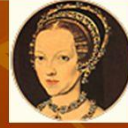
Jane Grey July 1553