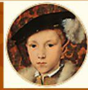
Edward VI 1547 - 1553