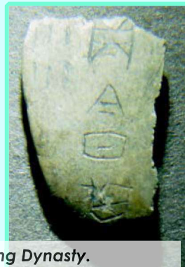
Oracle bones with writing on have confirmed the existence of the Shang Dynasty.